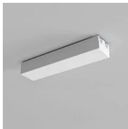
40120 Canopy with power supply Hush